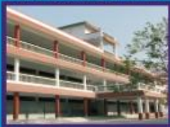
Dr. Rizvi Springfield School, Karari, Kaushambi