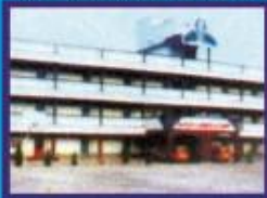
Dr. Rizvi Learner's Academy, Jaunpur