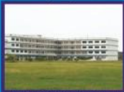
Dr. Rizvi College of Engineering, Karari, Kaushambi