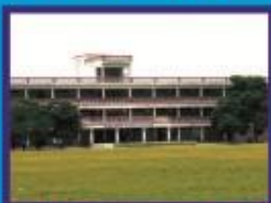
Dr. A.H. Rizvi Degree College, Karari, Kaushambi